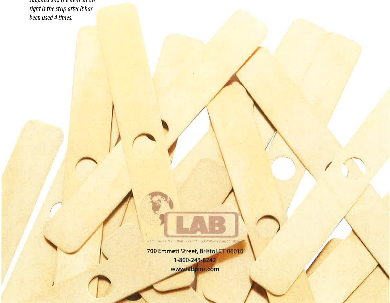
Image on the left is the item supplied and the item on the right is the strip after it has been used 4 times.